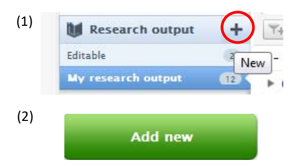
Option 1: Create from template

You can add a new research output through the 'Choose submission' screen, opened either by clicking on the + icon to the right of 'Research Output' on the left-hand menu (1) or by clicking on the green 'Add new' button within the right-hand menu (2).